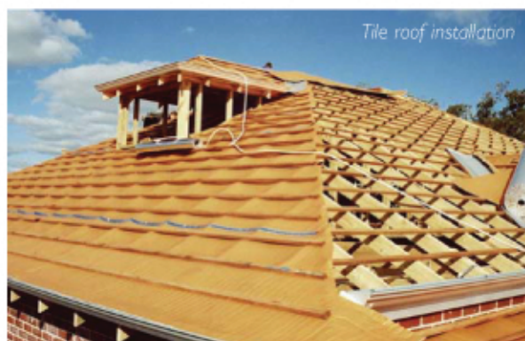
Tile roof installation

AIR-CELL® Insulation is Australia's leading thermo reflective insulation brand providing a clean, safe, fibre-free alternative to conventional bulk insulation. AIR-CELL® helps you achieve BCA compliance and a 5 Star house energy rating while acting as an all-in-one insulation and vapour barrier, replacing sarking and batts in a single application.