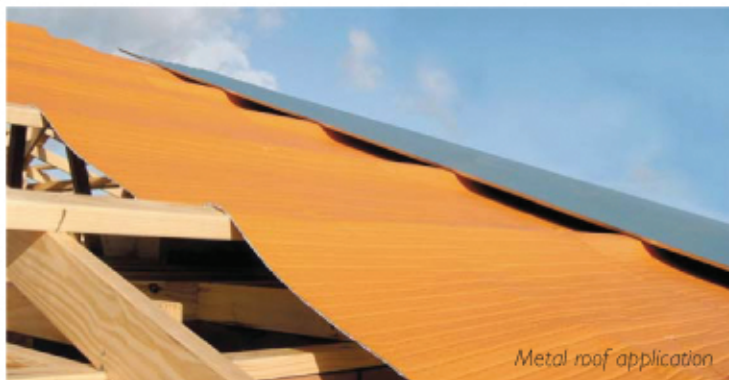
Metal roof application

the clean, fibre-free insulation alternative